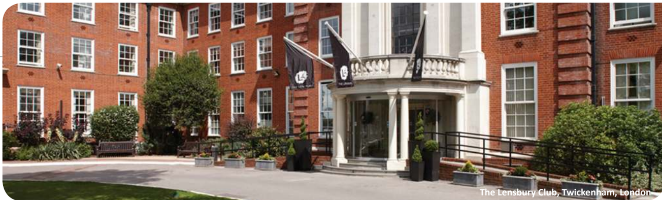
The Lensbury Club, Twickenham, London