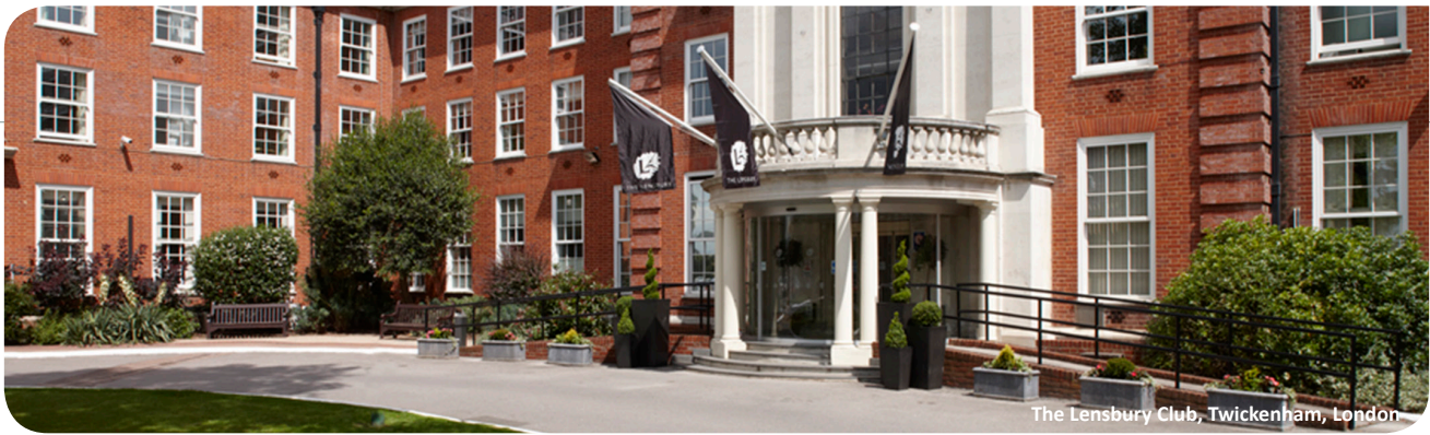
The Lensbury Club, Twickenham, London