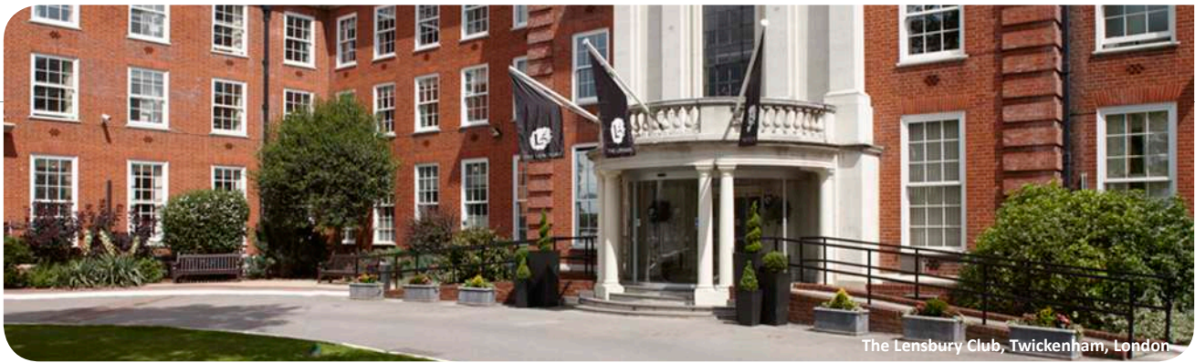
The Lensbury Club, Twickenham, London