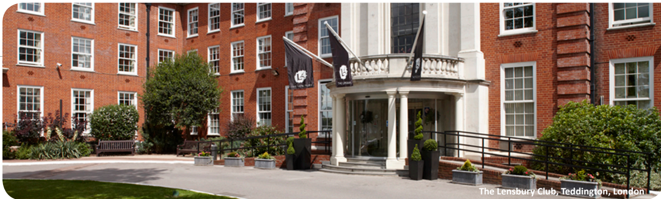
The Lensbury Club, Teddington, London