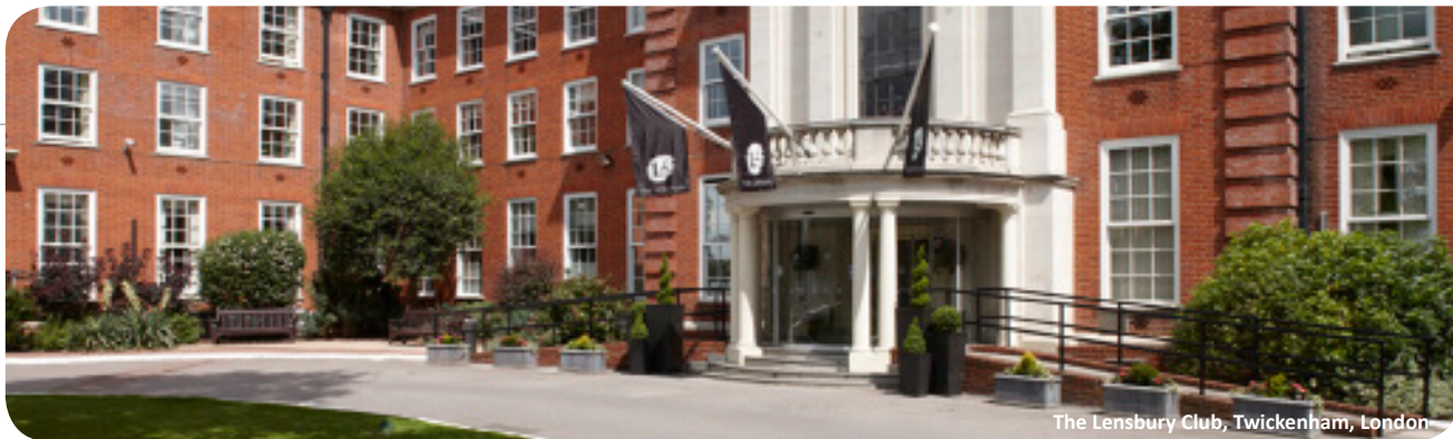
The Lensbury Club, Twickenham, London